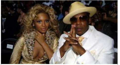
VMA's memorable couples Unforgettable pairs often pop up at this awards show. For instance, these ones